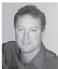
Mayor Brian Hanna

Phone: (07) 878 7227 Mobile: 021 726 282 Email: brian.hanna@waitomo.govt.nz Address: 160 Tate Road, RD2, Te Kuiti 3982.